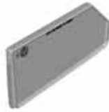
Illustration of the Cargo Dividers in the Vehicle